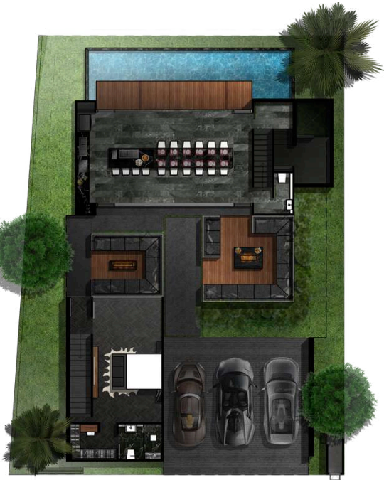
1st FLOOR 309 sq.m.