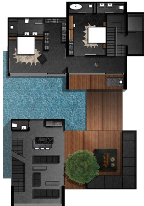
2nd FLOOR 321 sq.m.