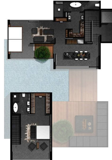
3rd FLOOR 185 sq.m.